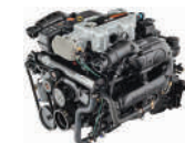
MerCruiser Inboards 8.2L One size doesn't fit all