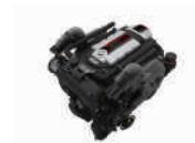
MerCruiser Inboards 6.2L One size doesn't fit all