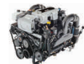
MerCruiser 8.2L Simple. Easy. Powerful.