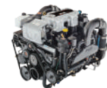
MerCruiser 8.2L Simple. Easy. Powerful.